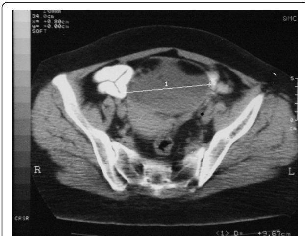
Figure 1 Abdominal computed tomography scan: a heavily triple tissular mass with greasy and osseous constituent (= 10 cm).